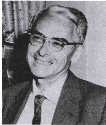
Jean Charlot (Photo c. 1959)

Charlot studied as a youth in the Ecole des Beaux Arts, Paris. In the last months of World War I, on finishing French military school, he was commissioned a lieutenant in the army and assigned to an artillery unit. After the German surrender in 1918 he was in