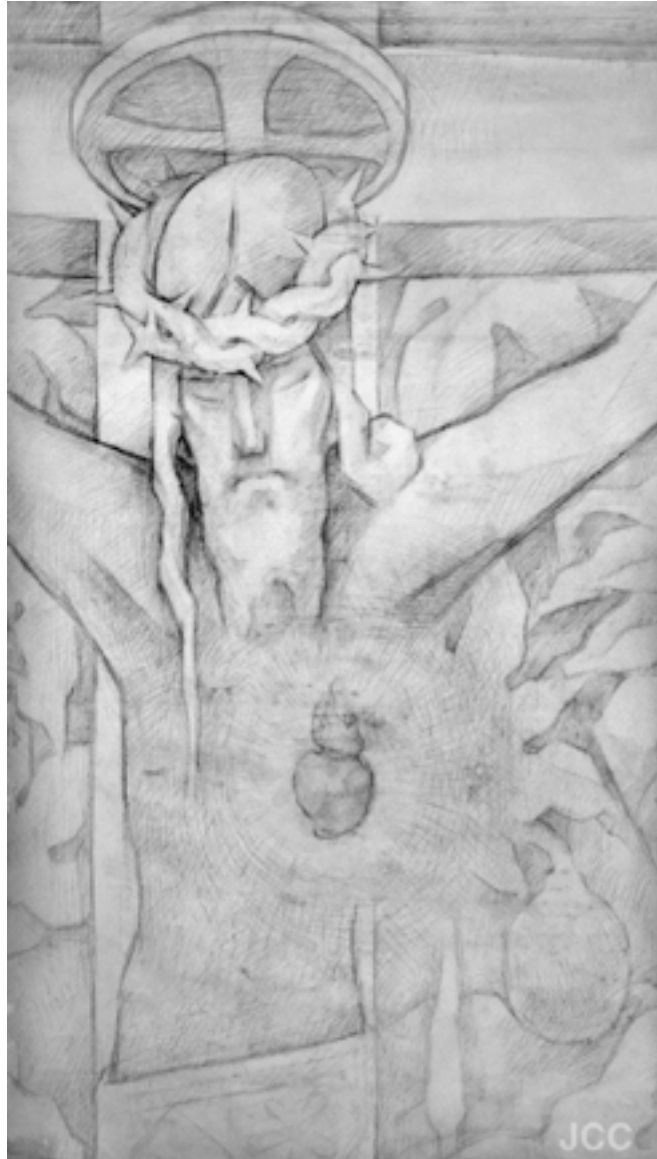
Illustration 6.39. Black Christ, black and brown crayon, 116 x 35 inches, scroll mount. (JCC.DM1962.1).