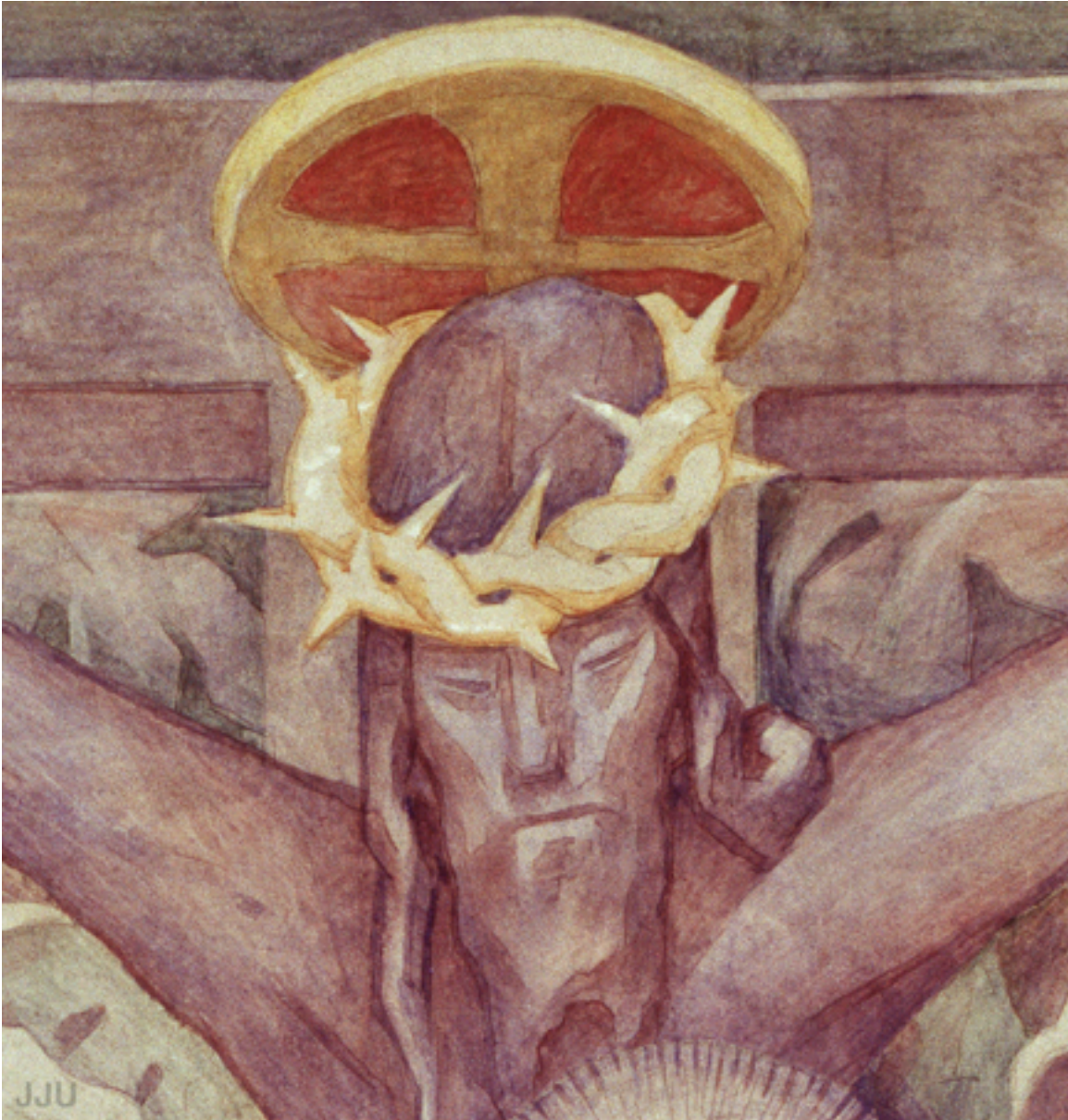
Illustration 6.41. Christ's face, detail of central panel, Black Christ and Worshipers , Jean Charlot, fresco, 1962, St. Francis Xavier's Catholic Church, Naiserelagi, Fiji. Photo Jesse Ulrick, September 2002. Collection of Caroline Klarr.