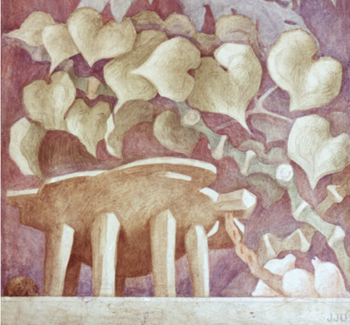
Illustration 6.35. Tanoa and bilo with background of yaqona leaves, detail of central panel, Black Christ and Worshipers , Jean Charlot, fresco, 1962, St. Francis Xavier's Catholic Church, Naiserelagi, Fiji. Photo Jesse Ulrick, September 2002. Collection of Caroline Klarr.