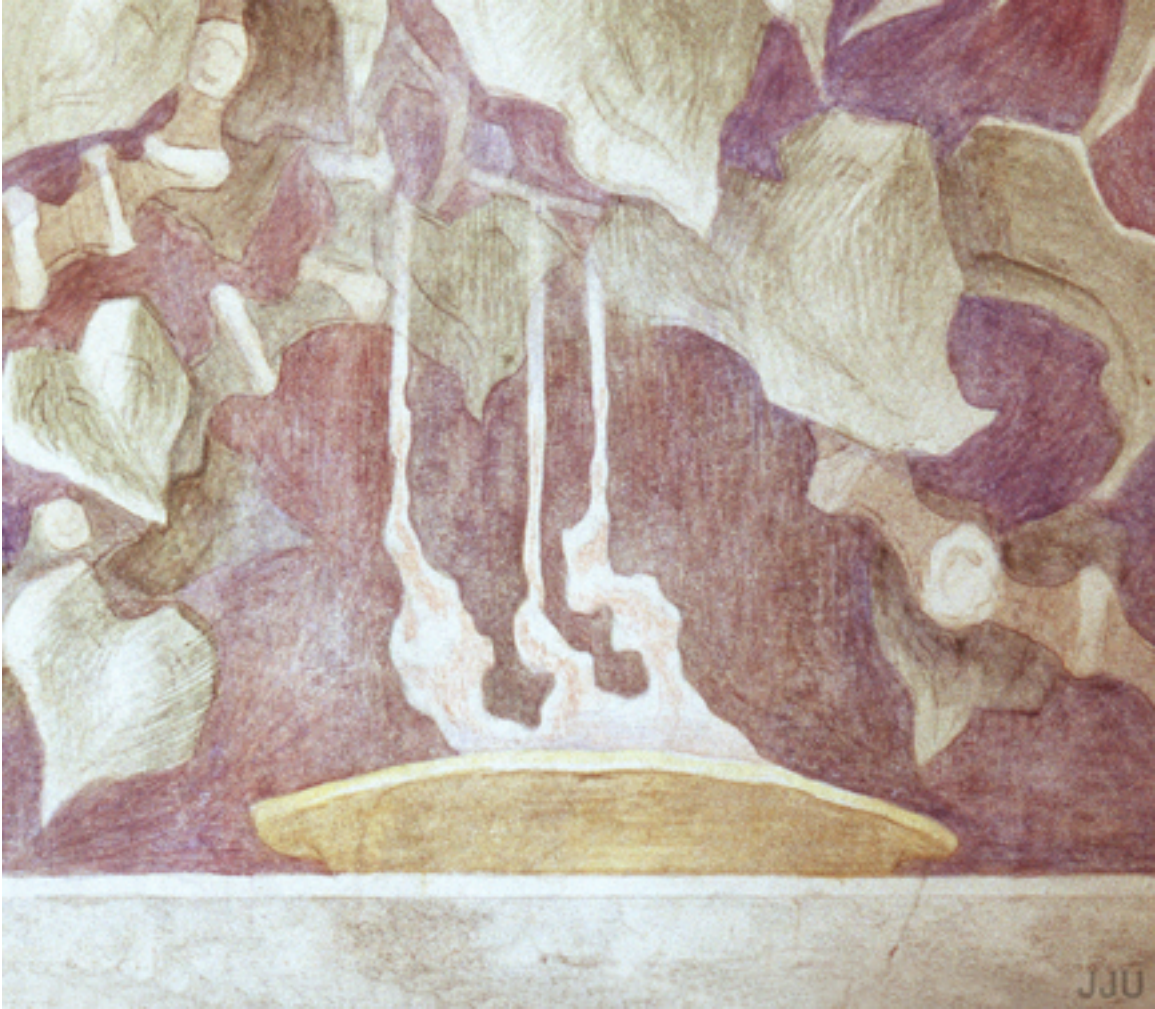
Illustration 6.36. Brass bowl and plumes of smoke, detail of central panel, Black Christ and Worshipers , Jean Charlot, fresco, 1962, St. Francis Xavier's Catholic Church, Naiserelagi, Fiji. Photo Jesse Ulrick, September 2002. Collection of Caroline Klarr.