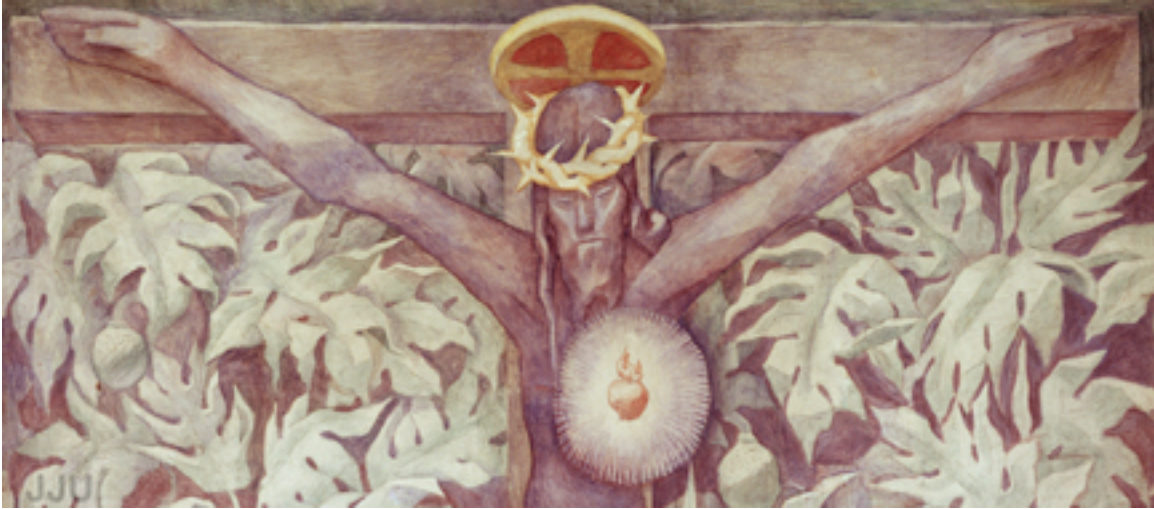
Illustration 6.40. Black Christ figure, detail of central panel, Black Christ and Worshipers , Jean Charlot, fresco, 1962, St. Francis Xavier's Catholic Church, Naiserelagi, Fiji.