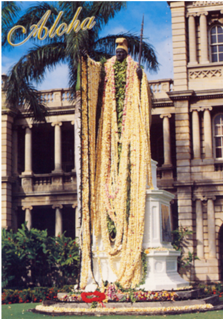
Illustration 6.29. Postcard of Kamehameha statue adorned with lei , Honolulu, Hawai'i. Garlands were also appropriate offerings for indigenous deities in the Pacific Islands, Asia, and Mexico.